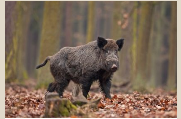
Wild Boar (Europe)